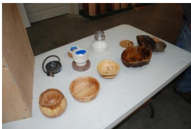
Various vacuum chucks and pieces turned with vacuum chucks