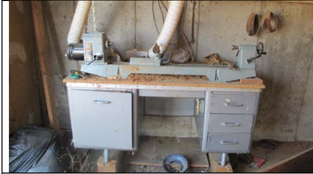
Delta Lathe mounted on table. 500-3,000rpm. 3/4 hp motor, 12" variable speed. Model 46-700.