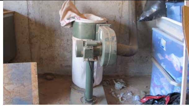
Grizzley Dust collector 1HP, 1988

If you are interested in any of the above items, please call Lyndel Saxbury at 482-8042.