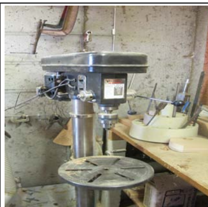
Guardian Power 16 speed 3/4 hp motor. Mfg 1988. 5/8# capacity. Model FDM 165P on Stand.