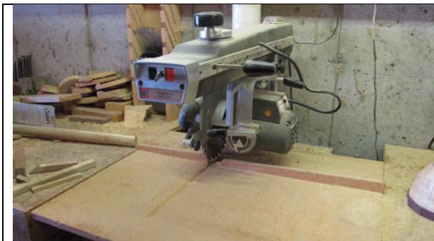
Black and Decker s 1/4 HP Dewast 10" commercial duty radial saw model 7770. Manual available.